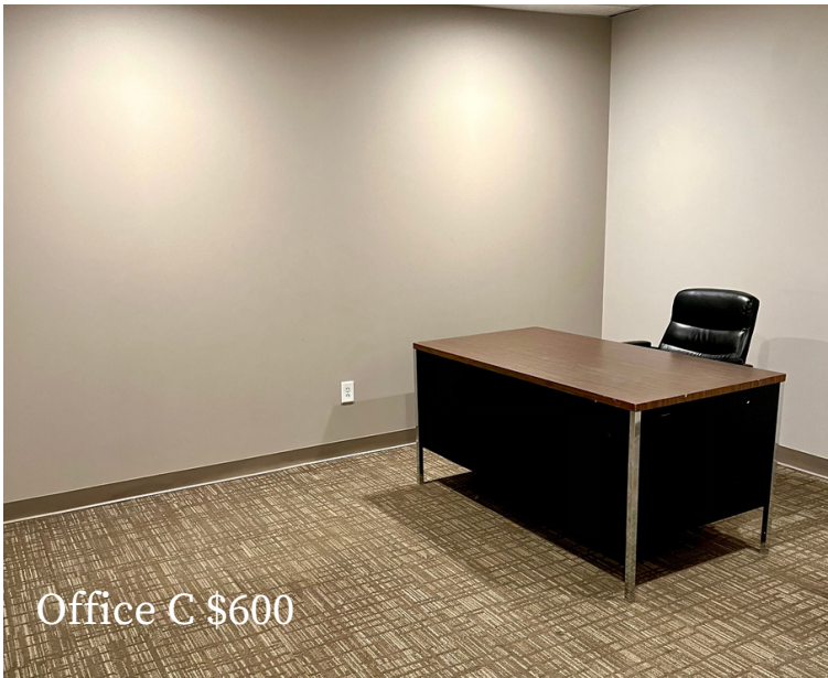
Office C $600