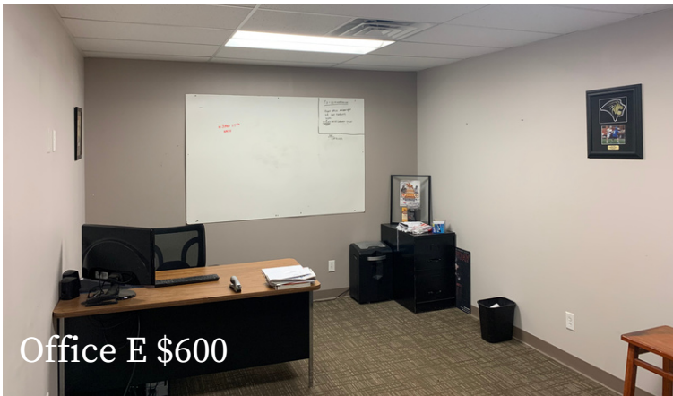
Office E $600