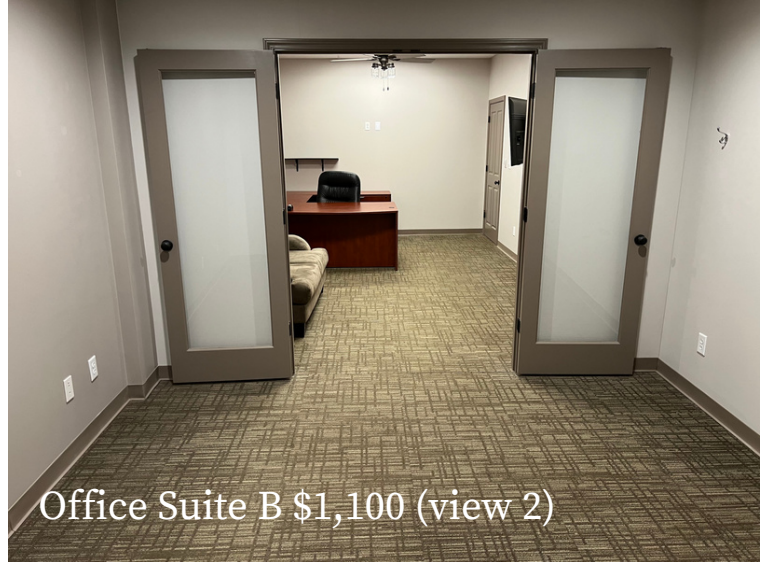
Office Suite B $1,100 (view 2)