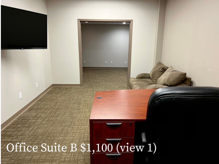
Office Suite B $1,100 (view 1)